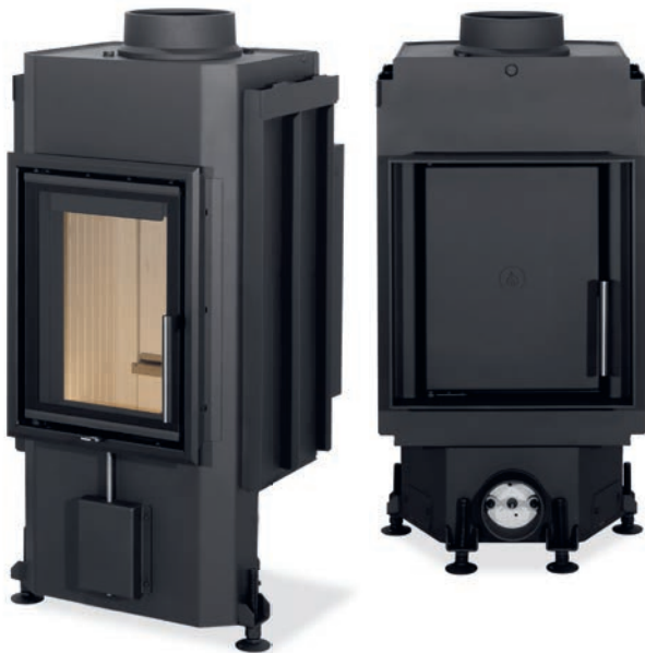
DYNAMIC B2G 35.46.01