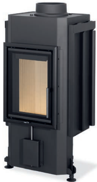
DYNAMIC 2G 35.46.01